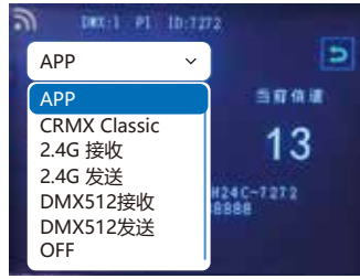
ballast control mode options