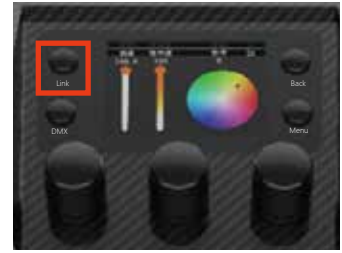
ballast pairing button