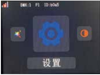
Ballast setting options