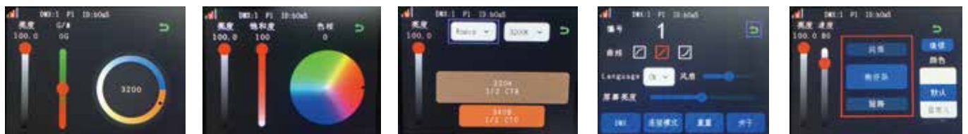
Color temperature menu Color temperature menu Gel menu Settings menu special effects menu