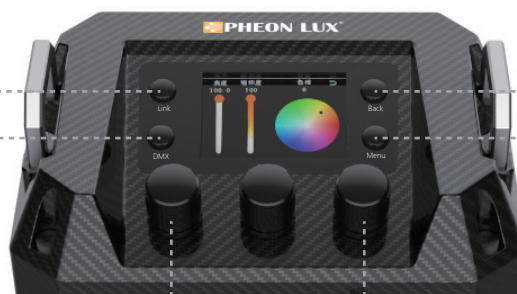
⑤ Adjustment knob