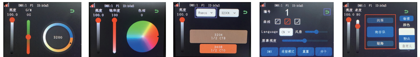
Color temperature menu Color temperature menu Gel menu Settings menu special effects menu