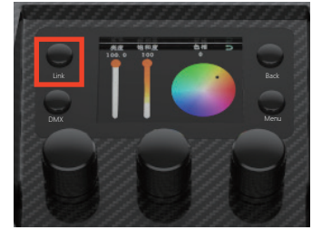
ballast pairing button