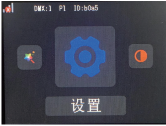
Ballast setting options