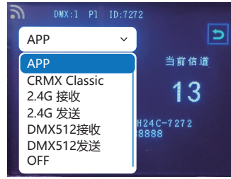
ballast control mode options